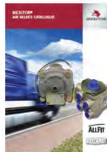
Air Valves New Release