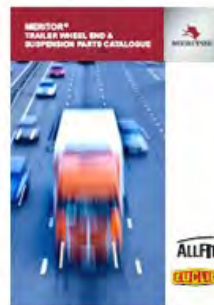
Meritor Trailer and Suspension Parts