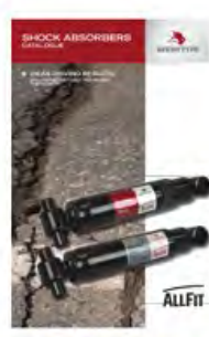
AllFit Shock Absorbers