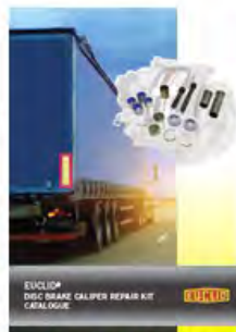
Disc Brake Caliper Repair Kits