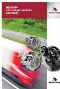
Disc Brake Calipers